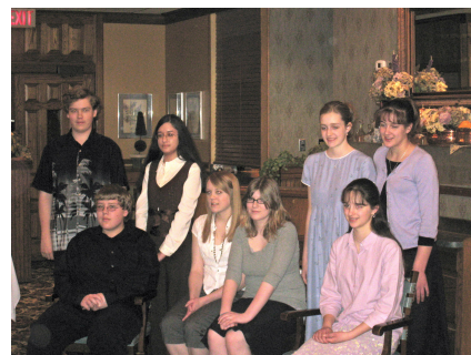
Junior Festival Performers