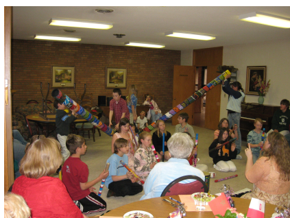
Hagan Elementary Students share African music