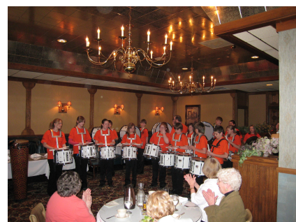
Williston Middle School Drum Line