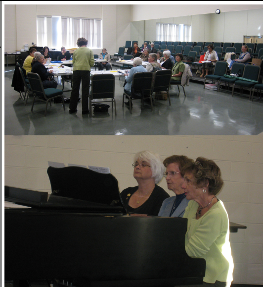
The NFMC Board of Directors at work in Jamestown

See you at the NDFMC Convention in Grand Forks on April 30-May 2 nd .